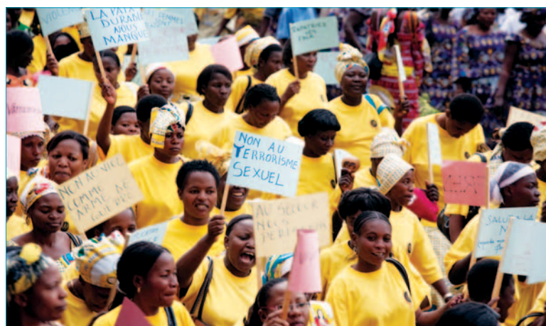
Women take part in World March of Women in Bukavu, South Kivu Province, DRC