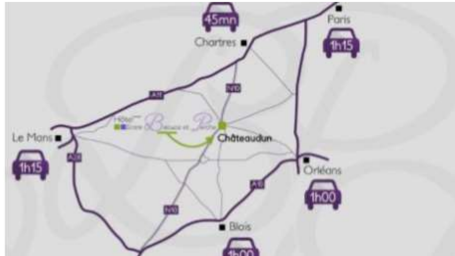
City at the Crossroads (Paris, Le Mans, Orleans, Chartres, Blois)

Chateaudun = 1hr 15 Mins from St Cloud Paris (two routes), 130 Kms