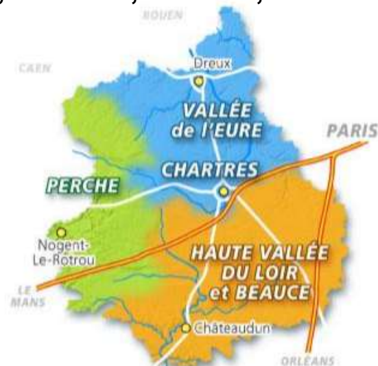
Upper Loire Valley Chateaudun at the Heart