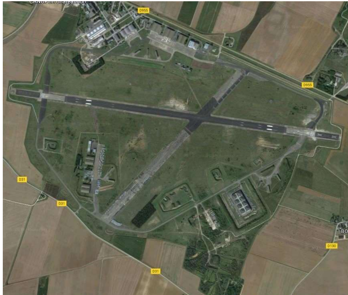
Aerial View of the airfield at Chateaudun: 2.3 Kms, 45 m (wide)