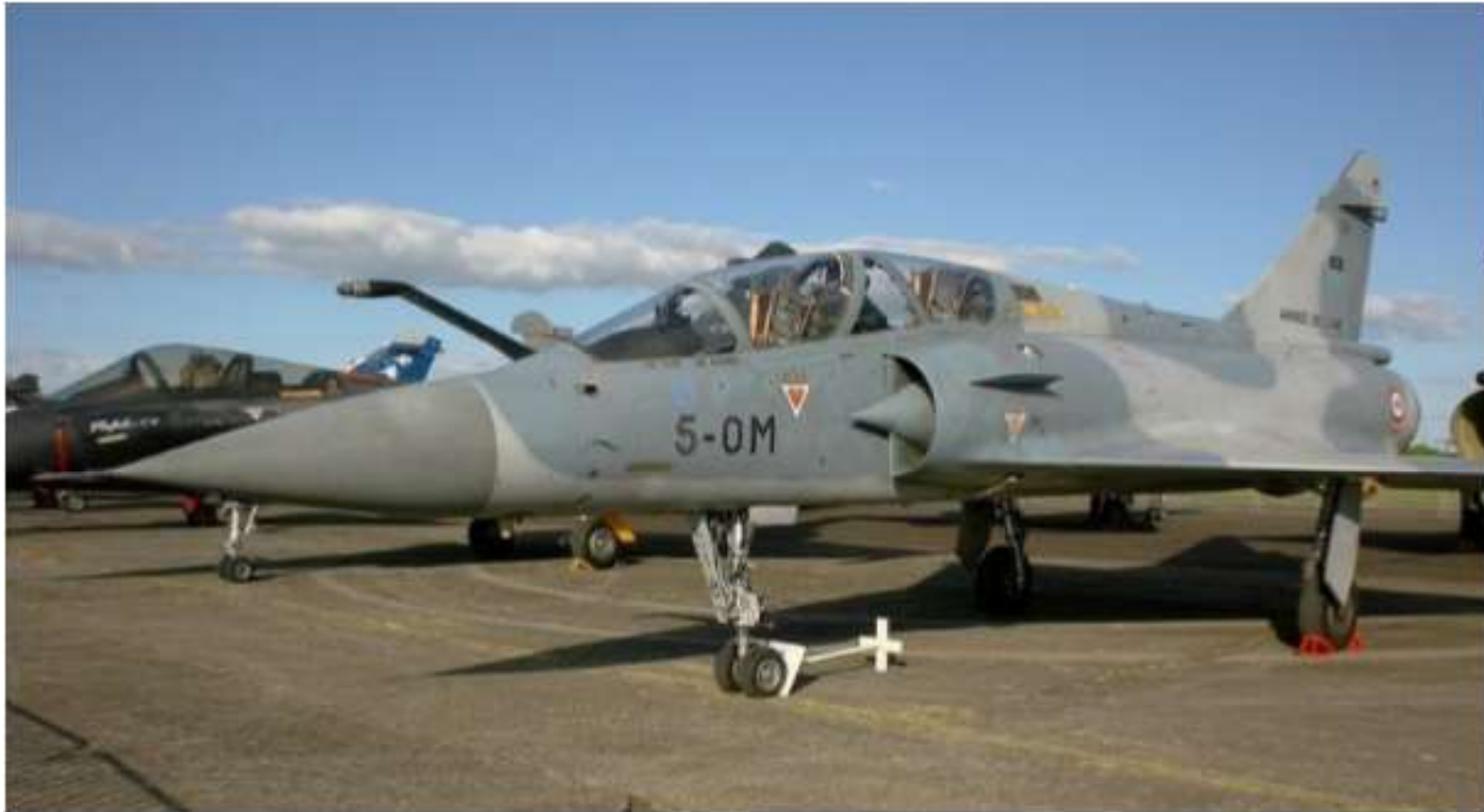
Aircraft Museum with 30 aircraft, Mirage 2000, Jaguar, Mirage III, Fouga etc