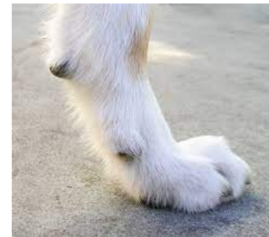
UNE PATTE une patte