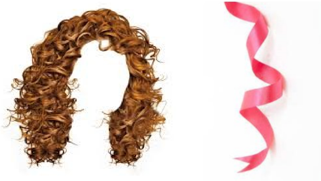
CHEVEUX ET RUBAN