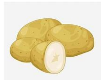
POMME DE TERRE