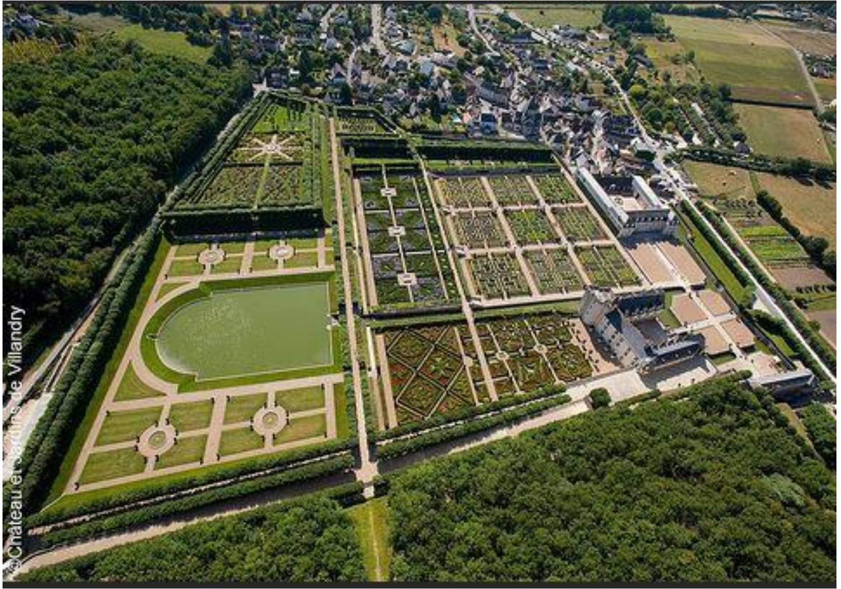
Château et Jardins de Villandry