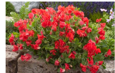
POIS DE SENTEUR