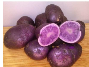
POMME DE TERRE BLUE STAR