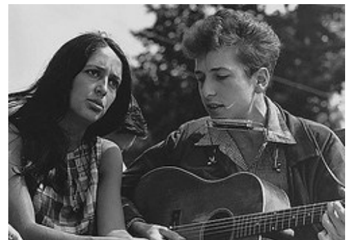
Joan Baez Bob Dylan