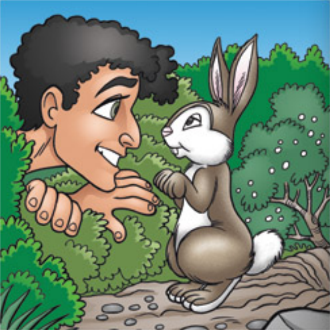
This is a rabbit.