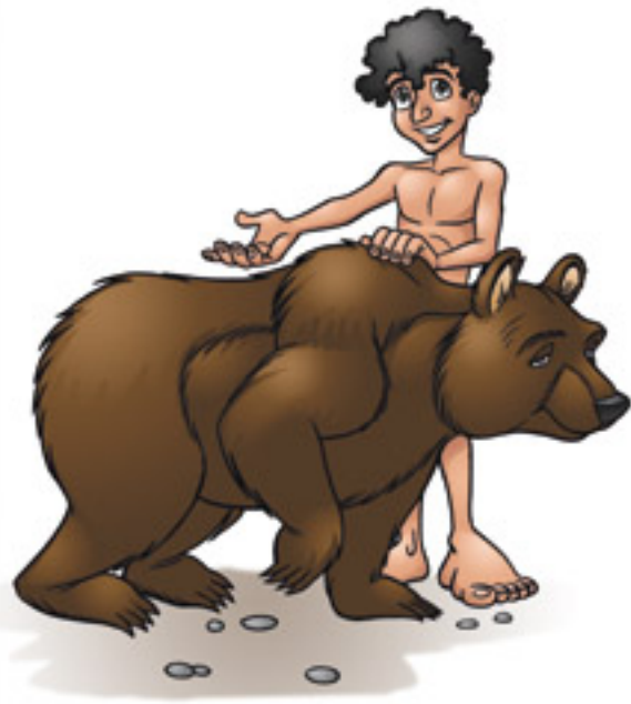
This is a bear.