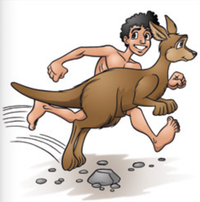
This is a kangaroo.