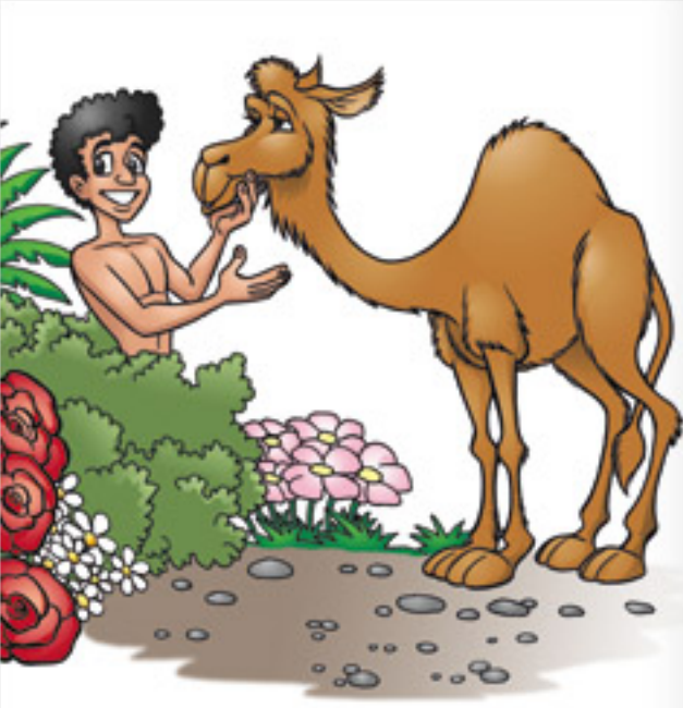
This is a camel.