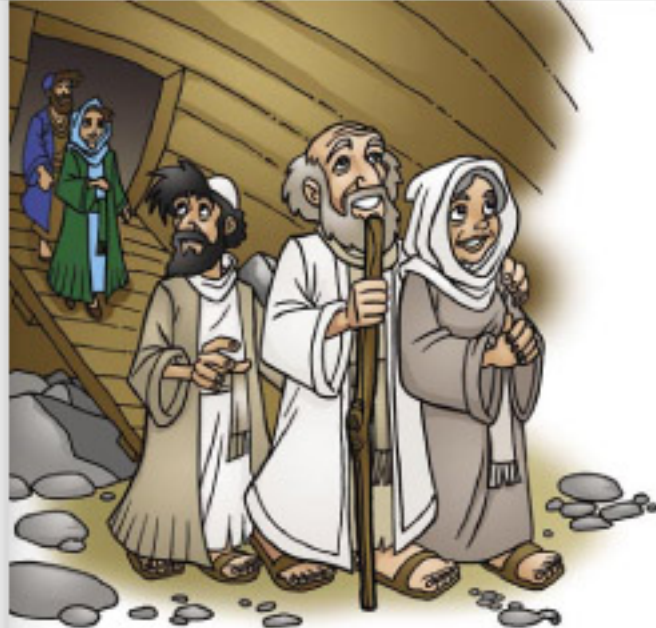
Noah and his family came out of the ark.