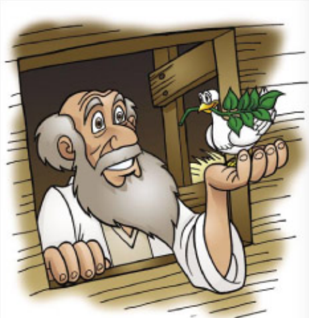
The dove found an olive leaf.