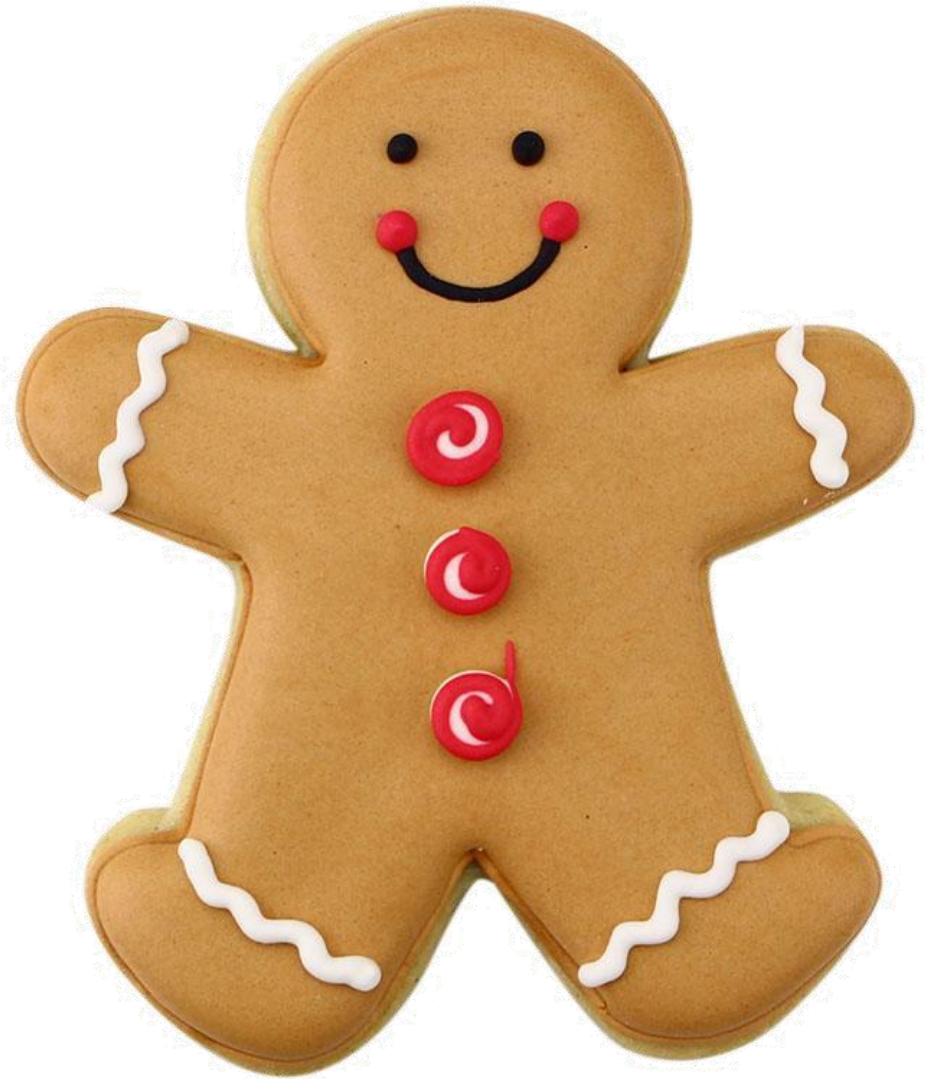
A GINGERBREAD MAN