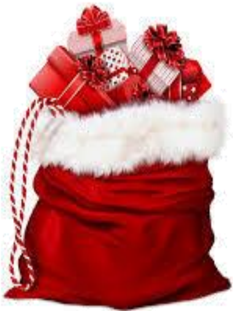
FATHER CHRISTMAS SACK