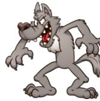
A big bad wolf.