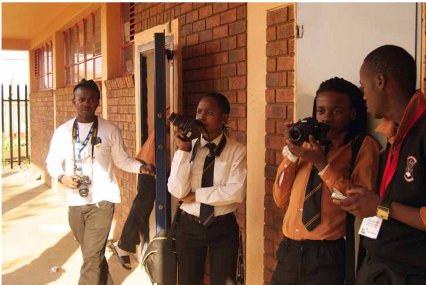
With Photographers Tjorven Bruyneel and Kutlwano Moagi February - March 2013

The Photo Workshop n°2 is taking place on February and March 2013, with photographers Tjorven Bruyneel and Kutlwano Moagi, at Buhlebuzile, focusing on twenty selected students from the previous workshop. External professional photographers take actively part in it, such as French freelance photographer based in Johannesburg, Bénédicte Kurzen and English photographer Jason Larkin. This workshop focuses mainly on developing their personal photographic skills by doing outdoor trainings and some research on photography, learning how to look and select photographs and how to edit their own works through photoshop.