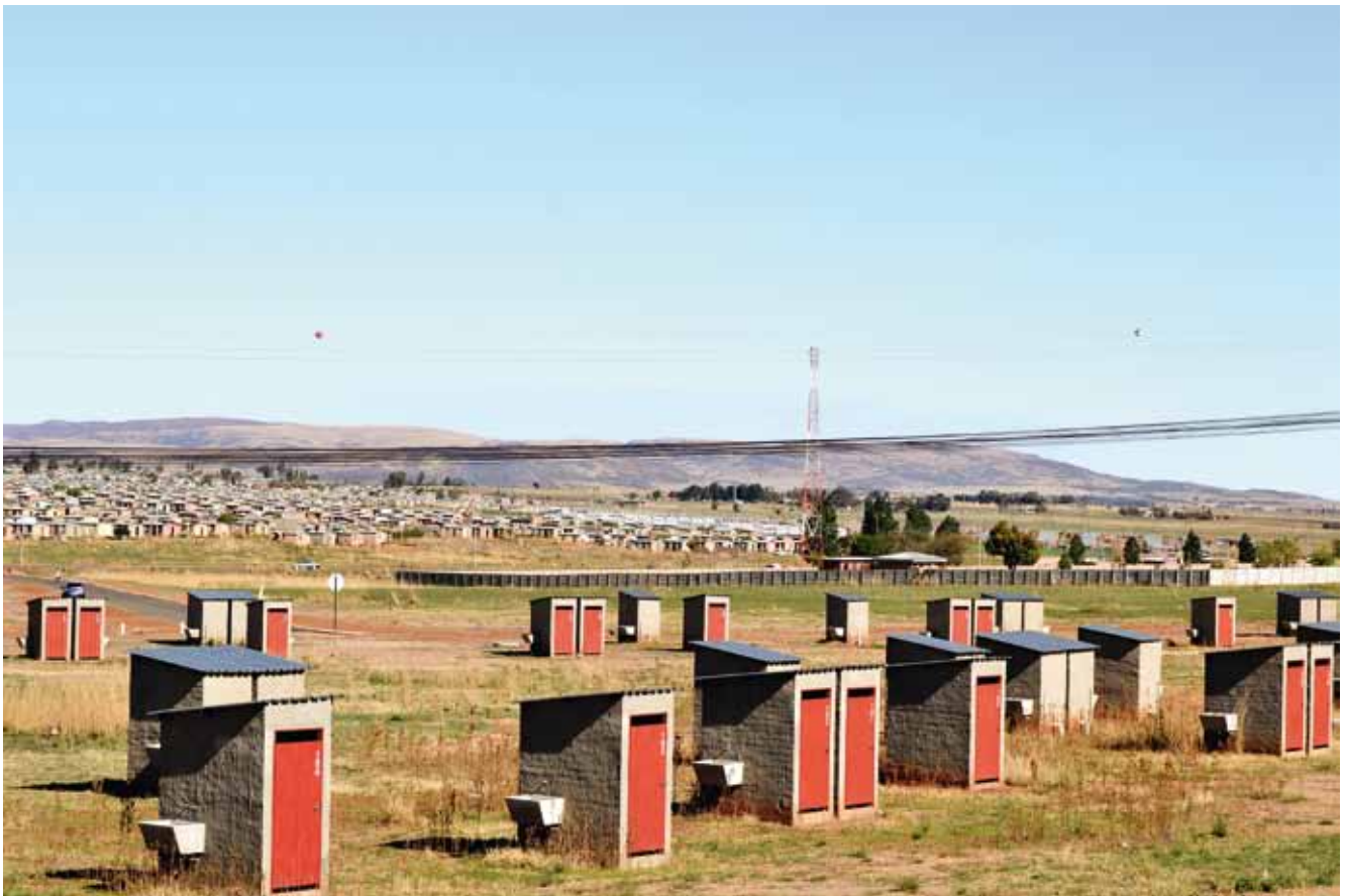
LINDOKUHLE SOBHEKWA Poor living conditions