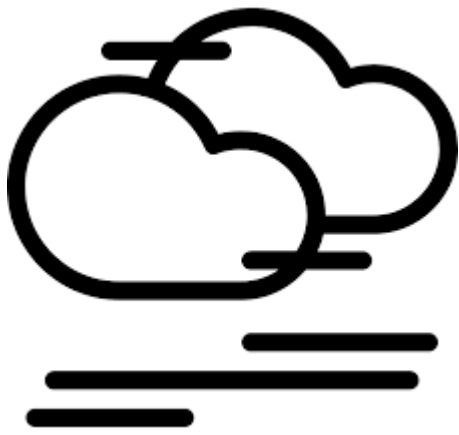
It's foggy .