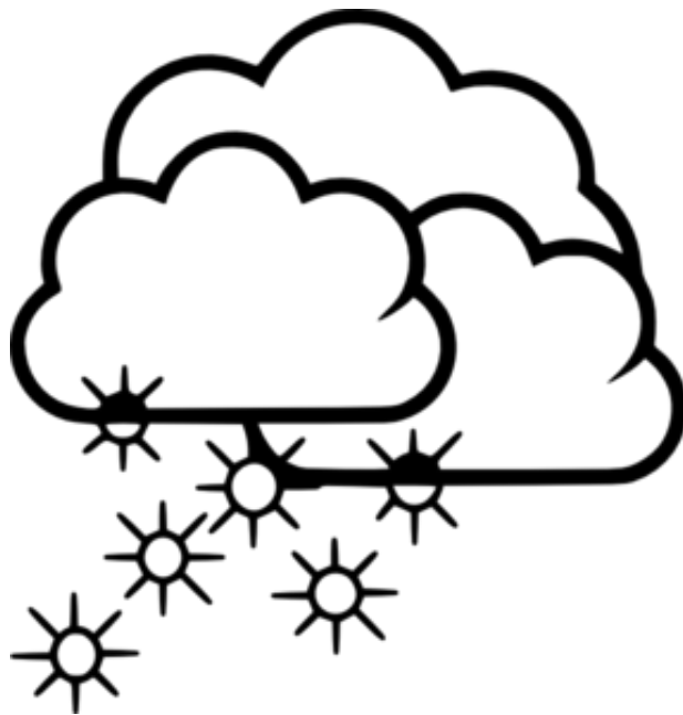
It's snowy .