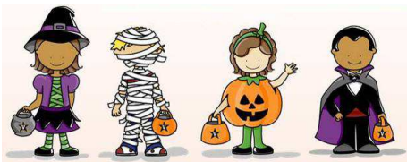
trick or treat