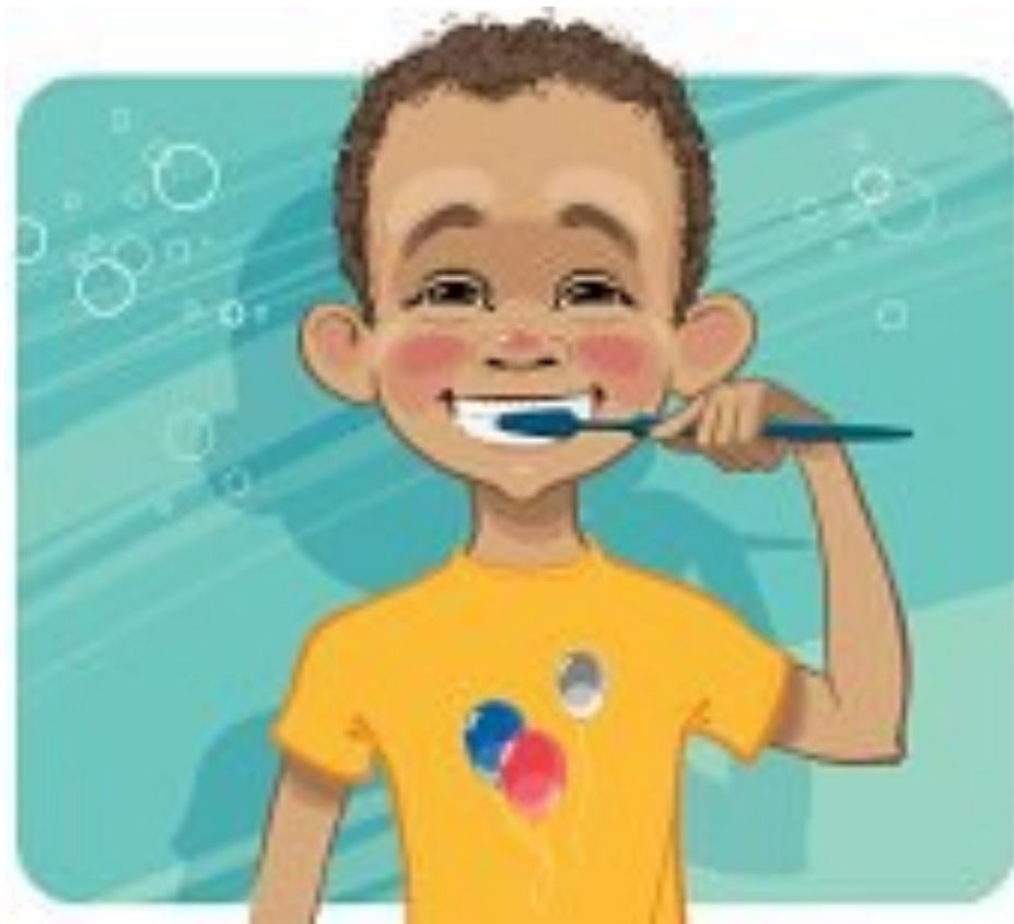
To brush your teeth