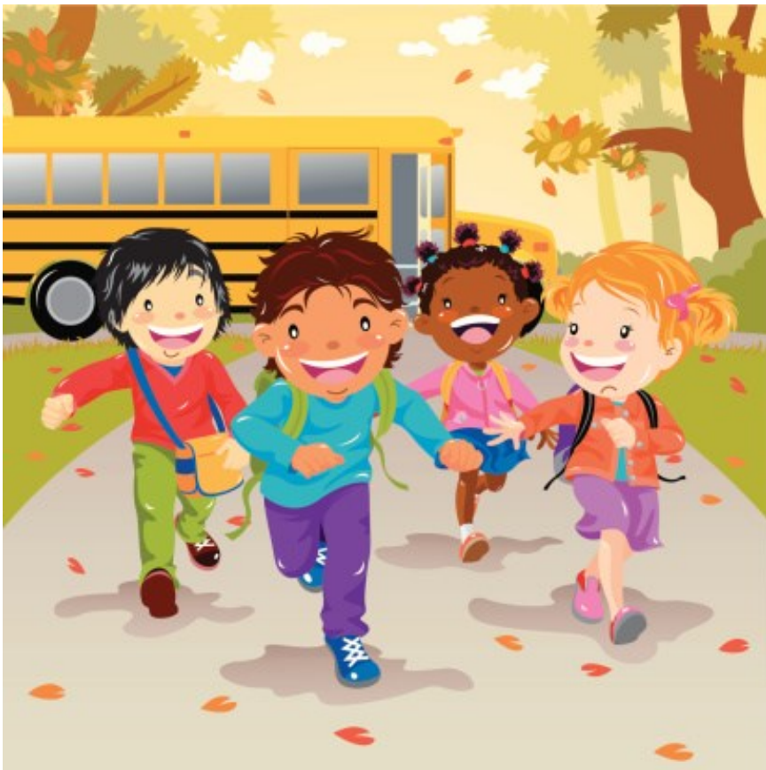
To go to school