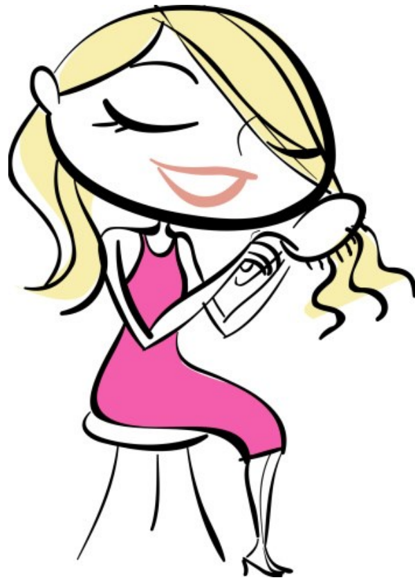
To brush your hair