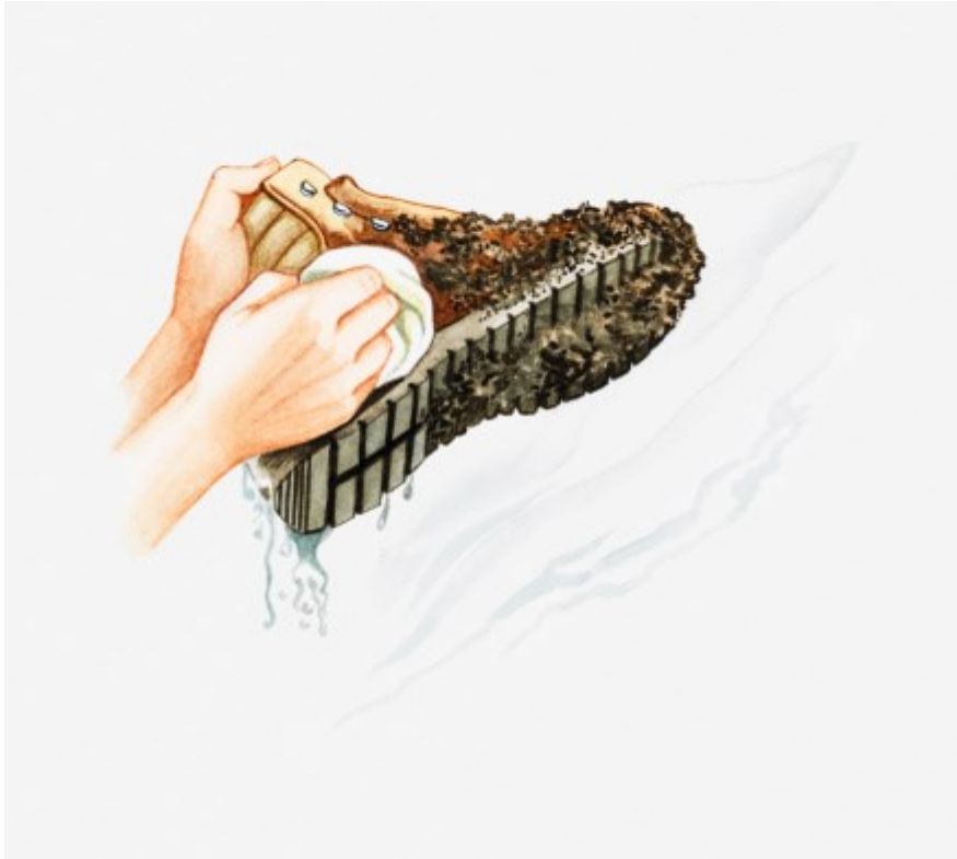
To clean your shoes