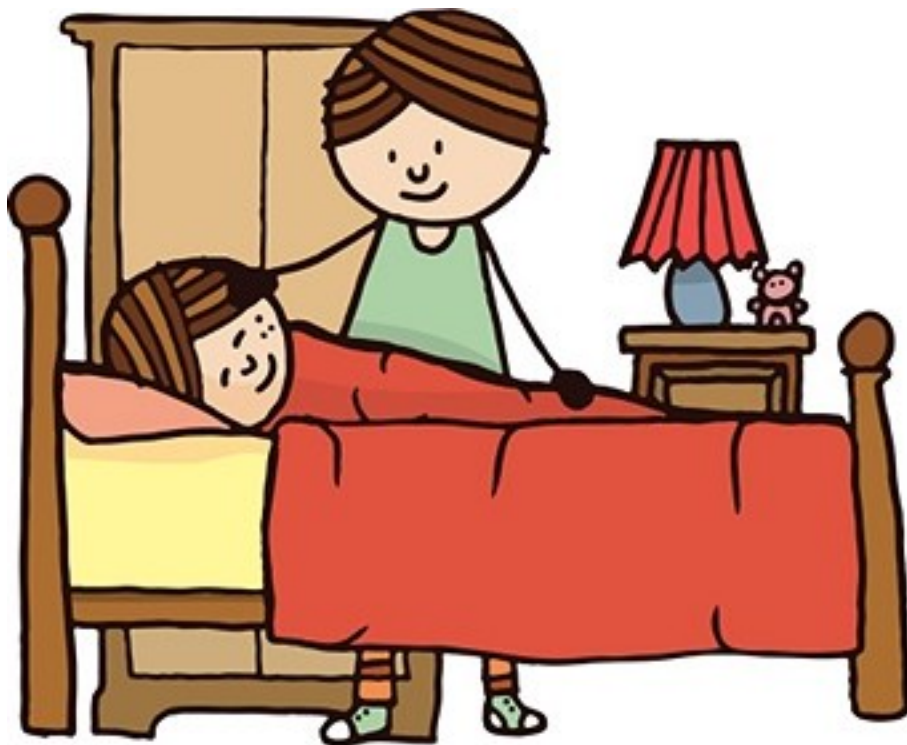
To go to bed