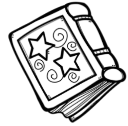
TABLE DE 6