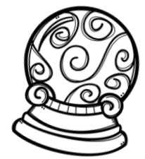
TABLE DE 2