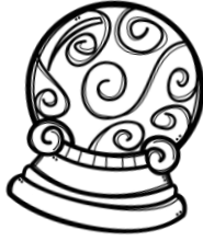
TABLE DE 7