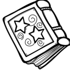
TABLE DE 11