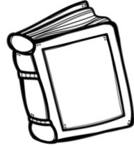
TABLE DE 8