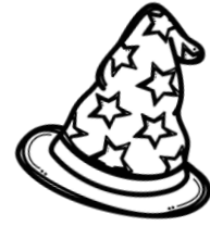
TABLE DE 10