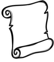
TABLE DE 12

Table de 7 ○ Table de 8 ○ Table de 9 ○ Table de 10 ○ Table de 11 ○ Table de 12 ○