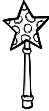
TABLE DE 9