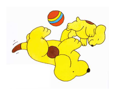
You're a big brother now, Spot! I like Susie, Mom. She's fun!