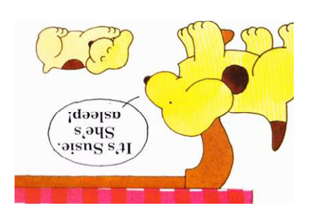
what's under the table, Spot ? It's Susie. She's asleep!