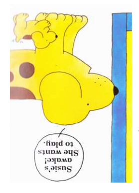
Who's there? Susie's awake! She wants to play.