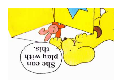
Spot looks for a toy for Susie. She can play with this.