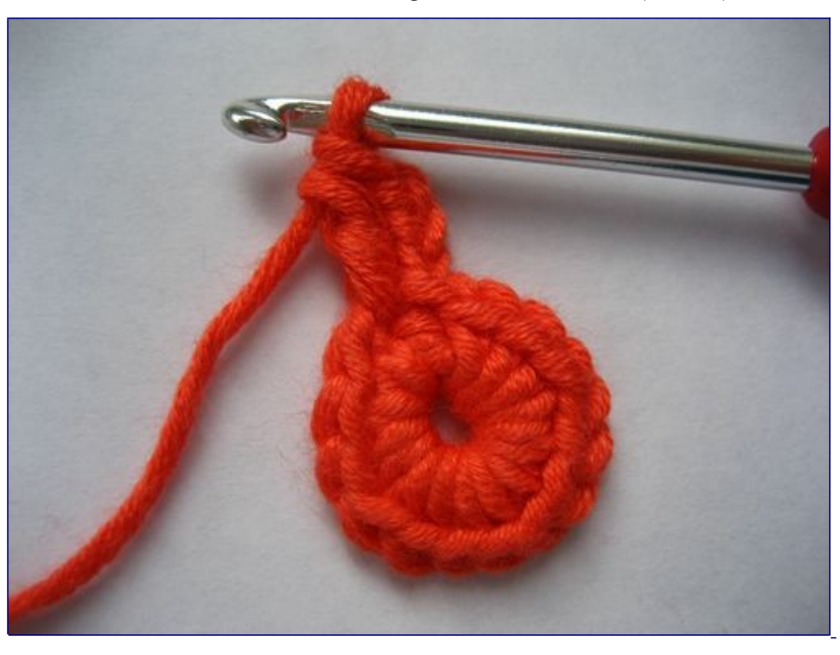
Round 1 :: Ch 1, then work 15 dc into the ring. Join with sl st in 1st dc (as above). [15 sts].

To begin :: ch 6 and join to form a ring.