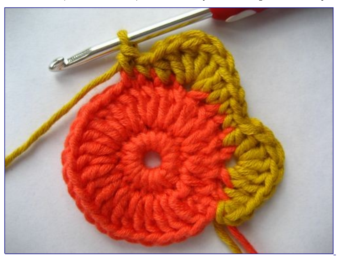
Work your second petal over the next five stitches (dc, htr, 5tr's, htr, dc)

Work 1 htr into next st, then 1dc into next st. This is your first petal made. It should take up 5 stitches in total (dc, htr, 5tr's, htr, dc). And remember, you are working out of front loops only, ok?