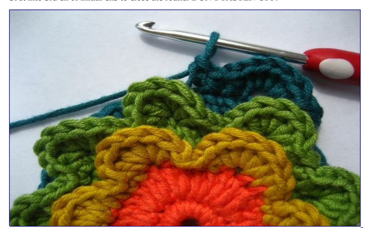
Round 7 :: yes, you got it, FRONT LOOPS ONLY for this round.

sl st into front loop of first st, ch1, then 1dc into same st.