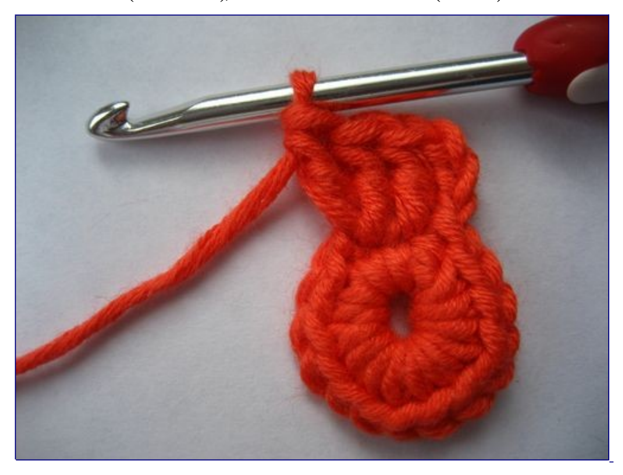
Work 2tr's into the next st.....