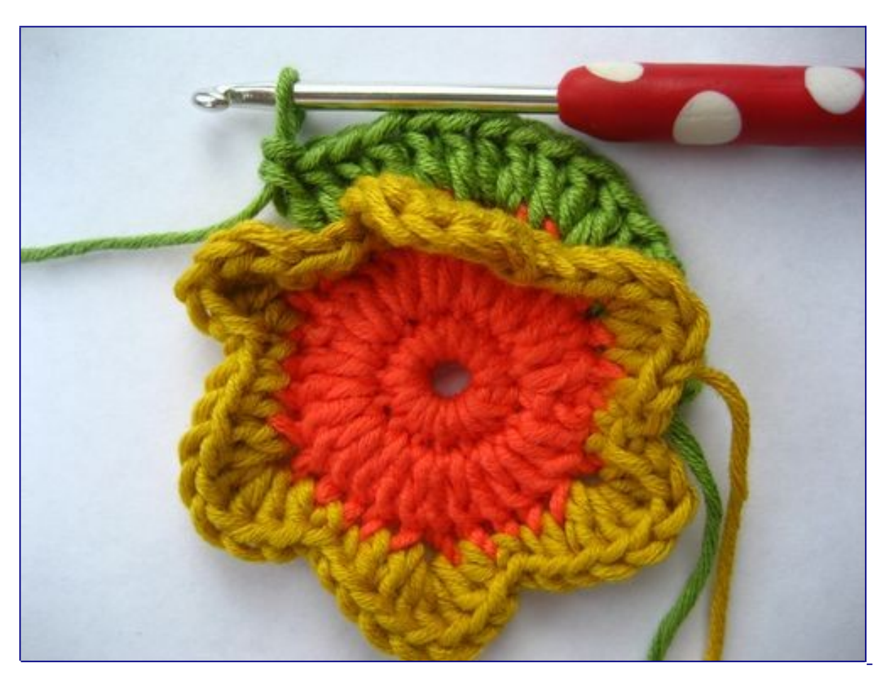
Repeat between ** all the way round. Sl st into 3rd ch of initial ch3 to close the round [45 sts]. DO NOT FASTEN OFF!