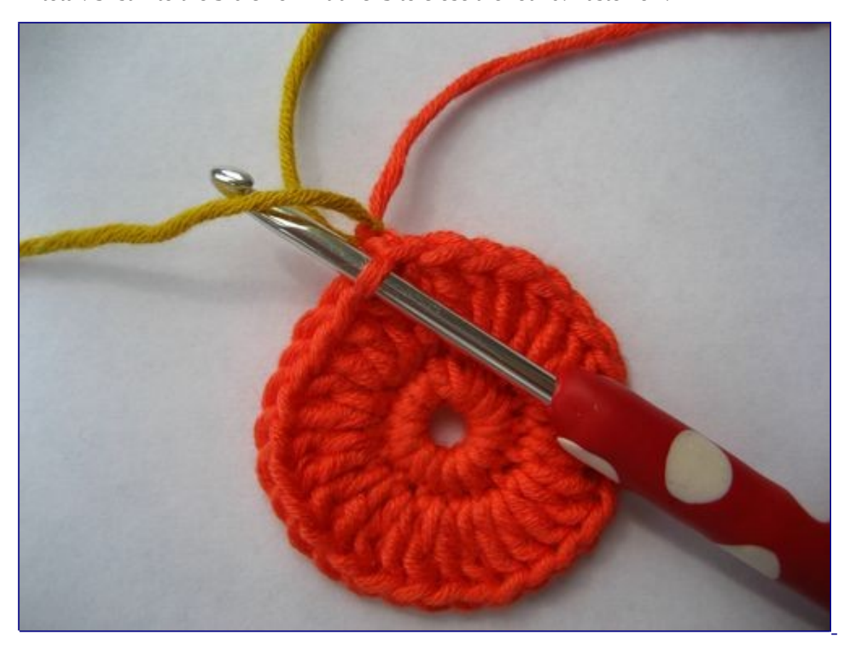
Round 3 :: NOTE :: you will be working this round out of the FRONT LOOPS ONLY, as shown above. Change colour by knotting your new yarn close to the stitches, leaving your tail ends to darn in later.

...and continue working 2 tr's into each stitch right the way around. You should end up with [30 sts] in total. Sl st into the 3rd ch of initial ch3 to close the round. Fasten off.