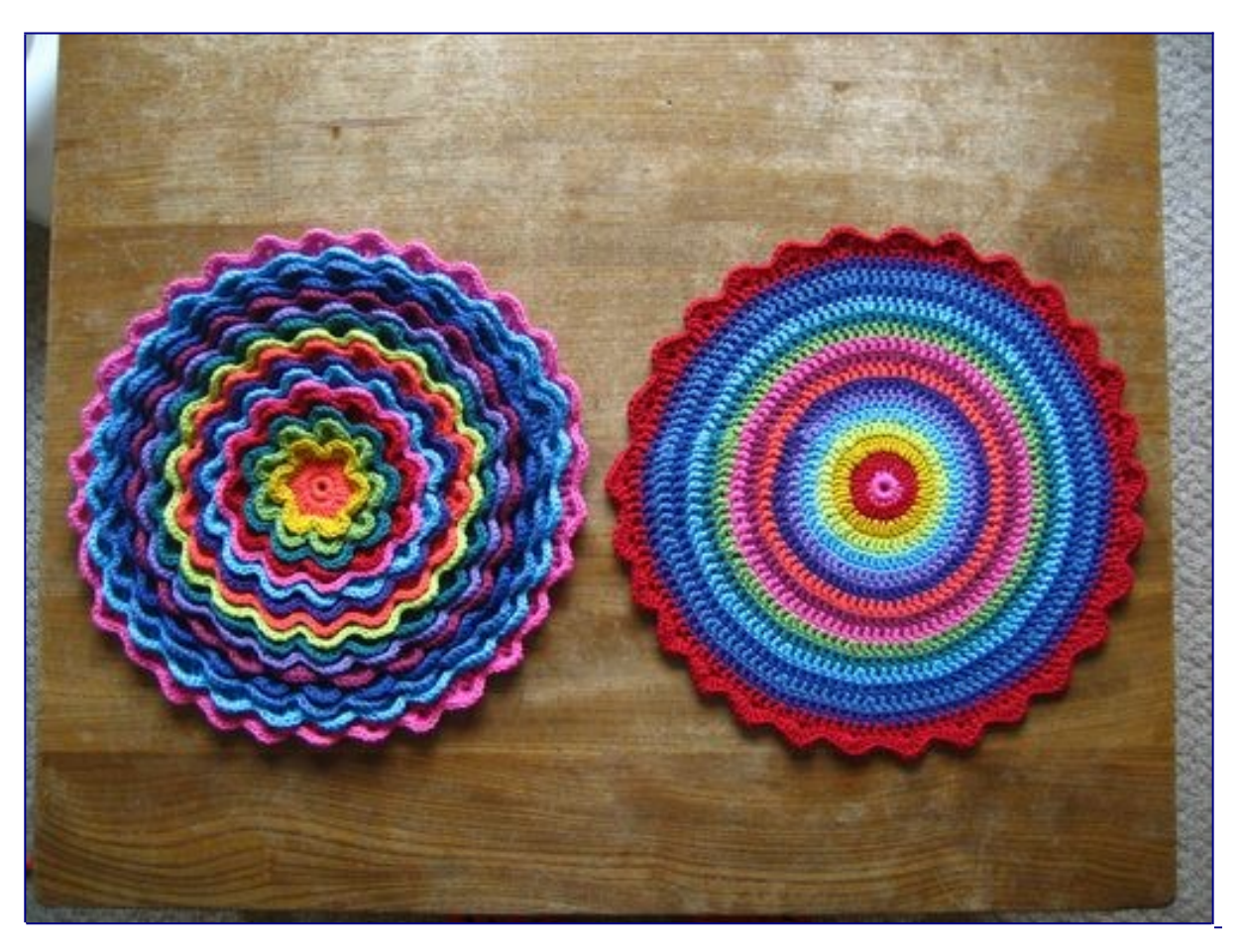
The very last round of the backside is a petal row, worked in front loops only.