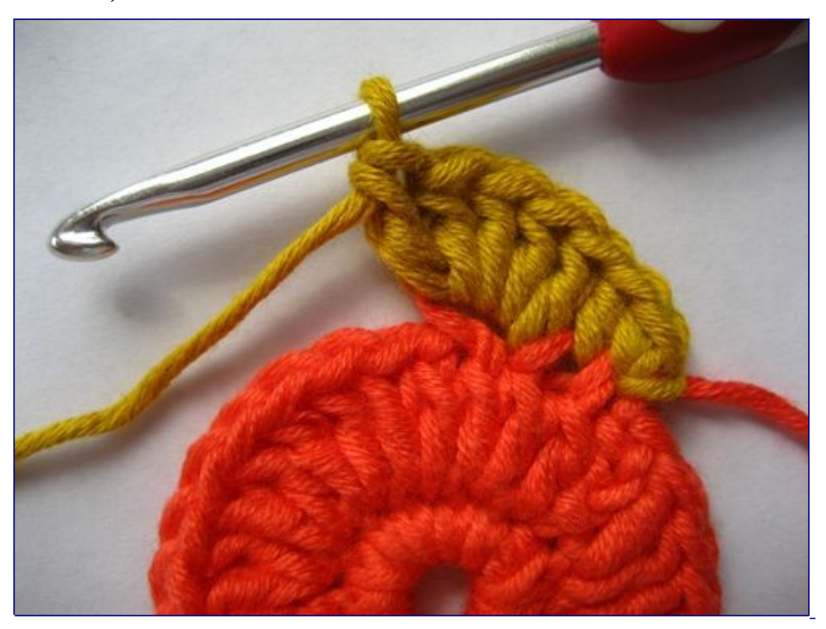
Now work the following :: 1htr into next st, 5tr's into next st (as above)

Insert hook through FRONT LOOP of first st. Ch 1, then work 1dc into same st (front loop remember!)