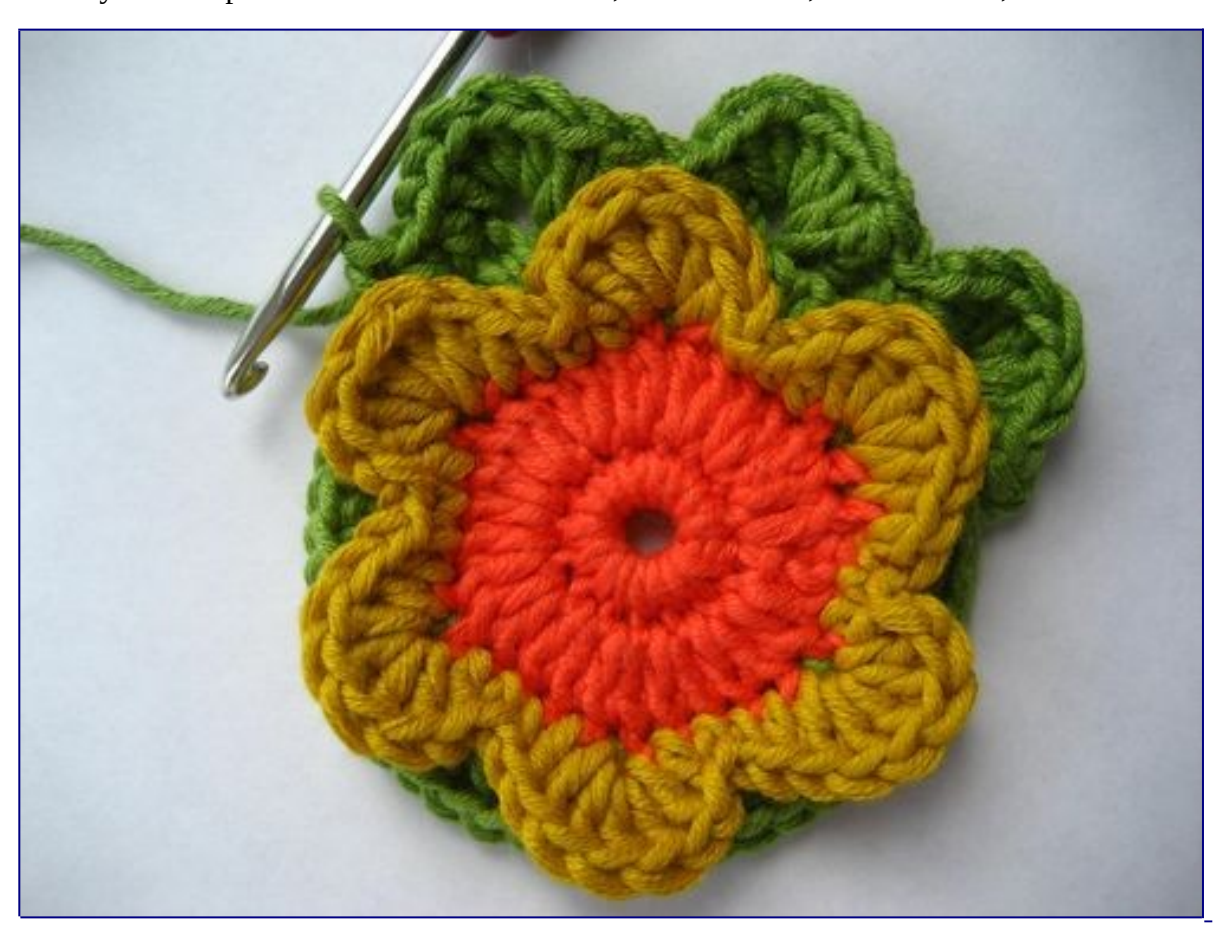
Work your second petal over the next five stitches (dc, htr, 5tr's, htr, dc), remembering Front Loops Only!! Think you've got that bit by now eh?!

Make your first petal as before...1htr in next st, 5tr's in next st, 1htr in next st, 1dc in next st.