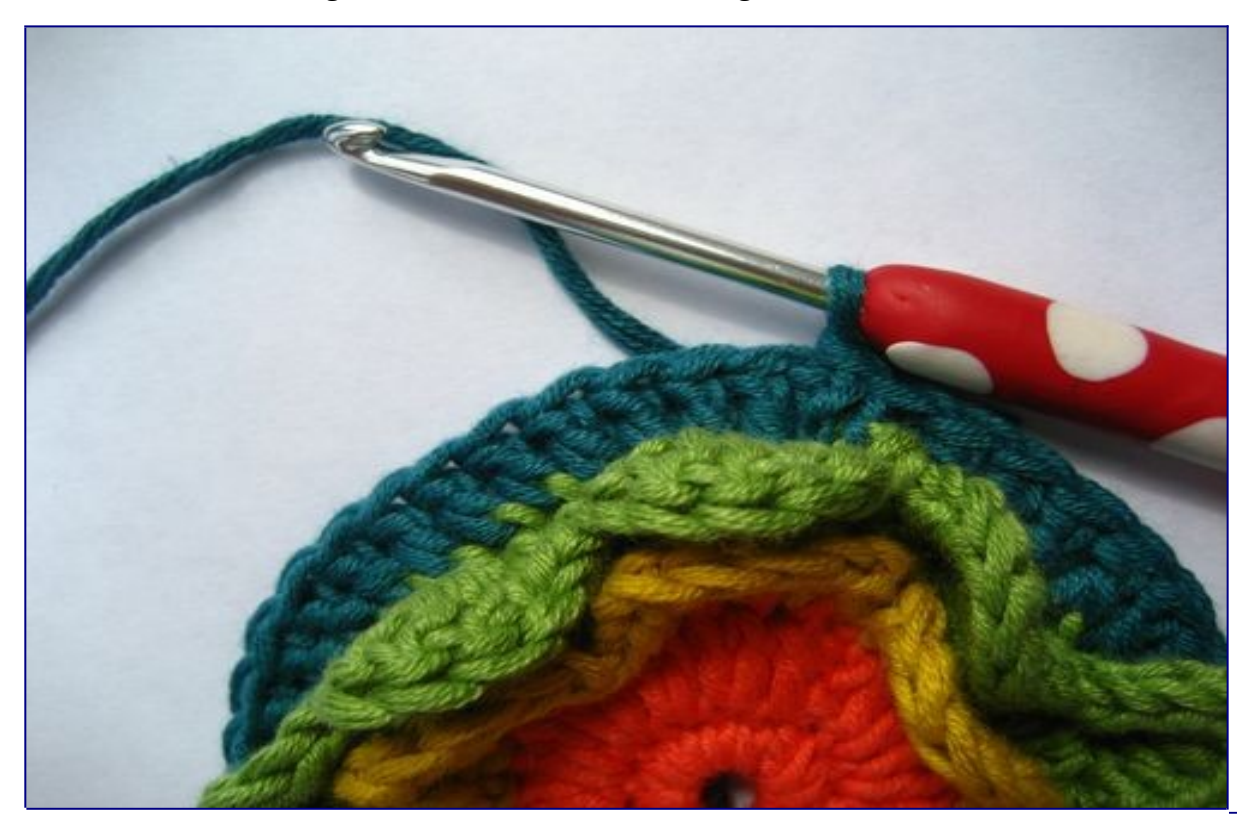
Ch 1 (counts as 1tr), then work 1t into each st [45 st's].

working this round out of the remaining BACK LOOPS of round 4, as shown above. You will hold your work with right side facing you, working behind the petals you made in the previous round. Pull a new colour through the first st to the front, leaving a tail end to darn in/work over.