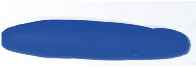
BOUDIN boudin boudin