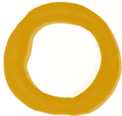
CERCLE cercle cercle