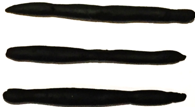
LIGNES HORIZONTALES lignes horizontales lignes horizontales