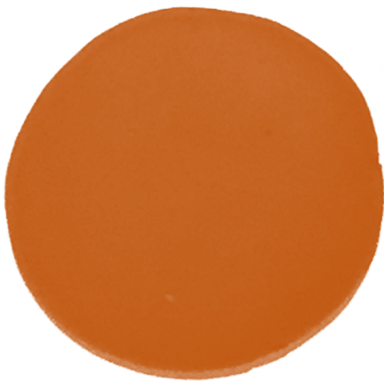
GALETTE galette galette