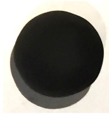
BOULE boule boule