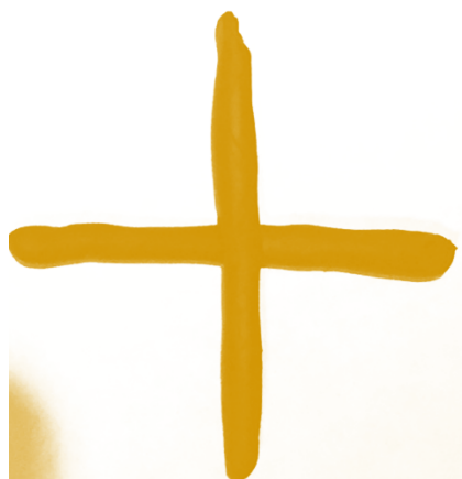
CROIX croix croix