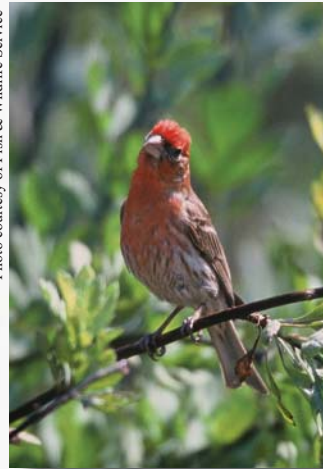
The House Finch is commonly seen at Tent Rocks – the male has a bright red chest while the female is brown with bold streaks.

The National Recreational Trail is for foot travel only, and contains two segments that provide opportunities for bird-watching, geologic observation and plant identification. Both