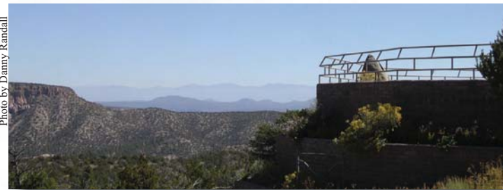
From the Veterans' Memorial Scenic Overlook, you can see spectacular vistas of Camada and Peralta Canyons, the Dome Wilderness, and Jemez Mountains.