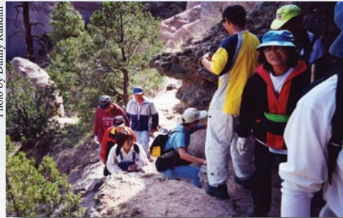
The Monument serves as an outdoor laboratory for educational groups.

canyon with a steep (630-ft) climb to the mesa top for excellent views of the Sangre de Cristo, Jemez, Sandia mountains and the Rio Grande Valley. Both trails are maintained; however, during inclement weather the canyon may flash flood and lightning may strike the ridges.