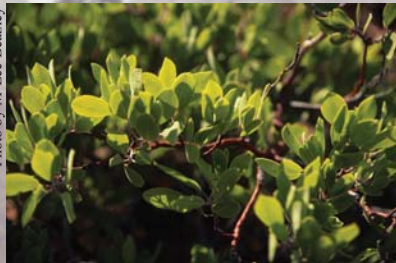
Manzanita—used for medicinal purposes by Native Americans.