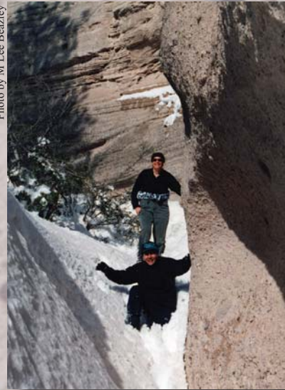
Hikers enjoy all seasons at the monument.

The national monument is a Standard Amenity Fee Site. All your fees are returned to the site for monitoring, maintenance, and improvements. Please have exact change.