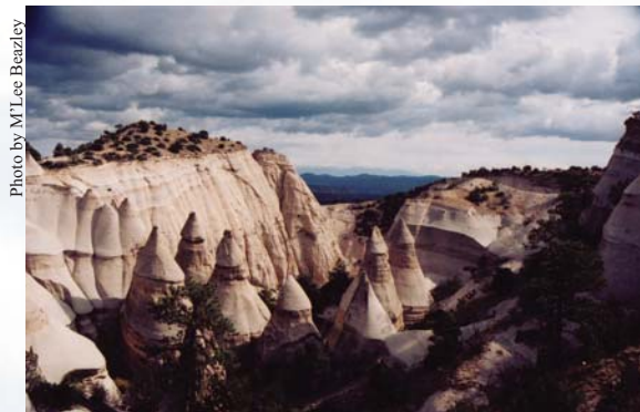
A beautiful view from atop the Canyon Trail.