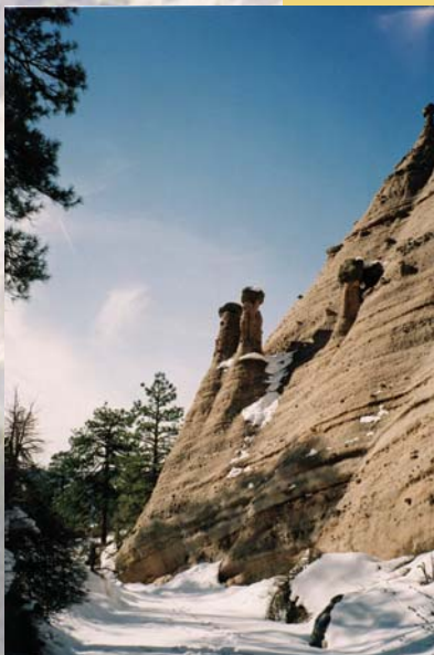
A spring snowfall blankets the canyon trail.