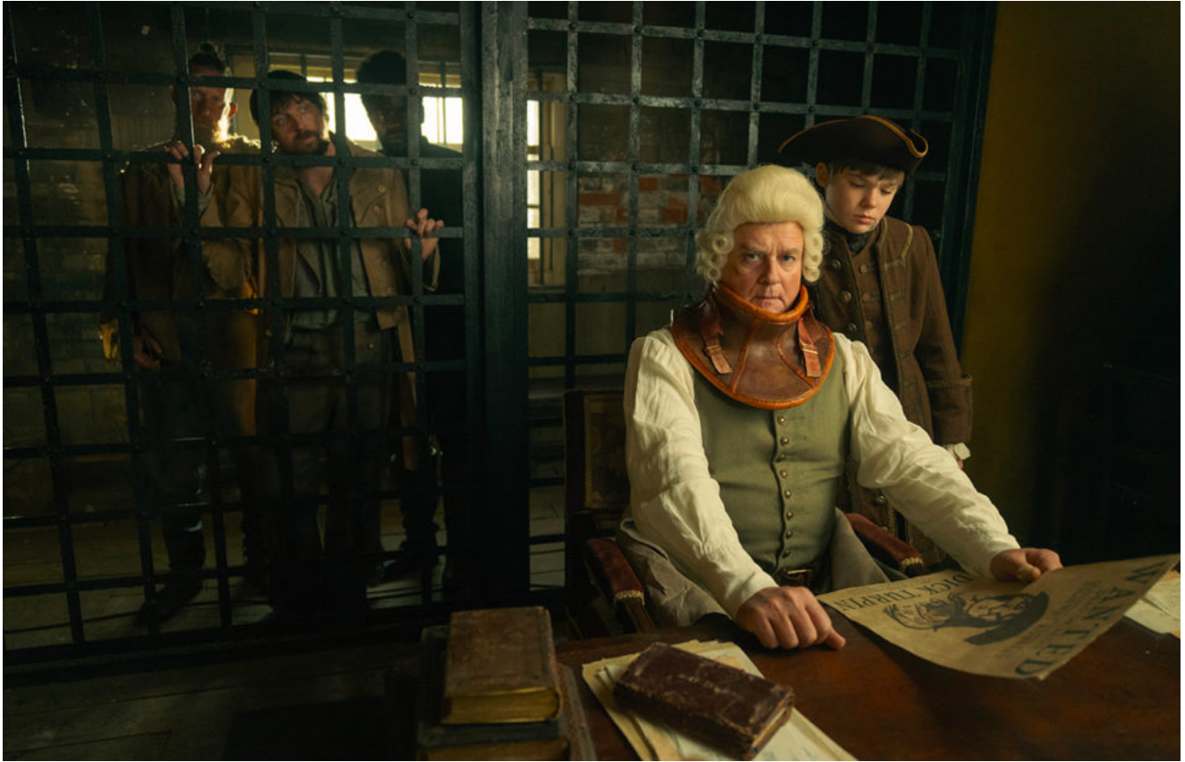
Hugh Bonneville as Jonathan Wilde, determined to catch Dick Turpin.

Find out more about Robin Hood in Shine Bright 5e and more about penny dreadfuls in Shine Bright LLCER .