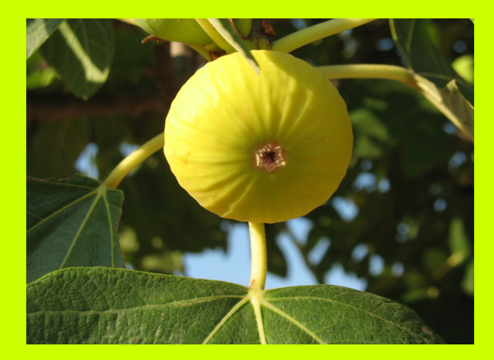
FIG harvest took a quantum loop with Isabelle another acrobat !