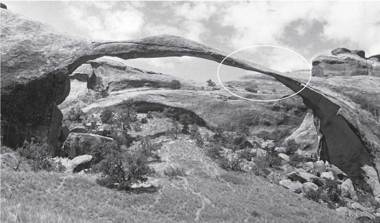
Landscape Arch in the 1950s. Oval indicates area from which rock fell in 1991.

it. Arches’ Salt Valley is an example of the resulting landform. At the edges of the valley the cracked rock was pulled apart slightly. Rain and snow could even more readily soak into the vertical cracks, dissolve the cementing minerals, and loosen grains of sand to be carried away by running water. (The erosional power of water is demonstrated during summer thunderstorms when the normally