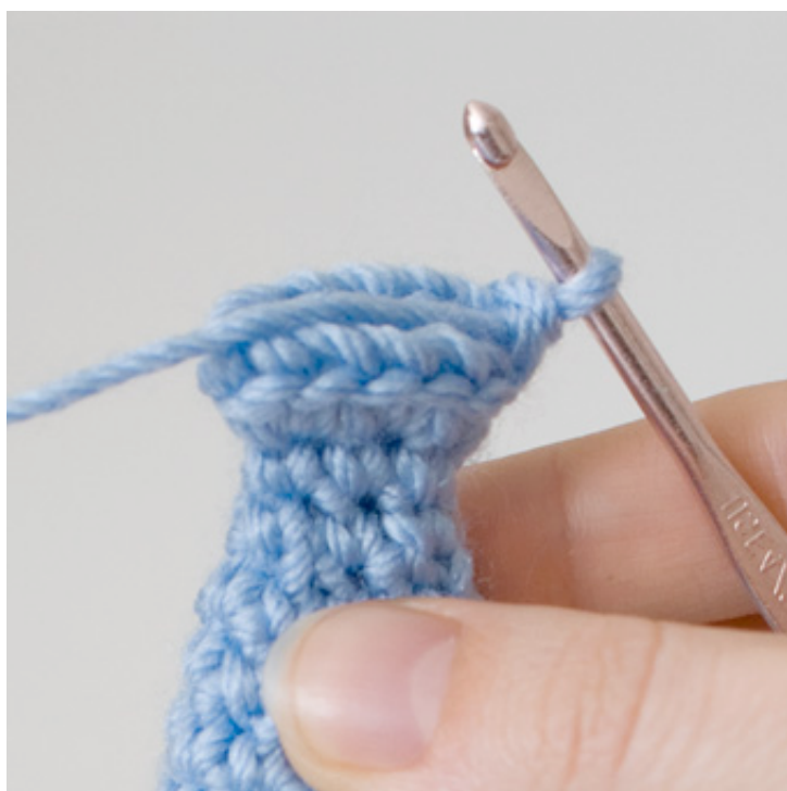
Sc around until hook is at corner of flattened tail, as pictured