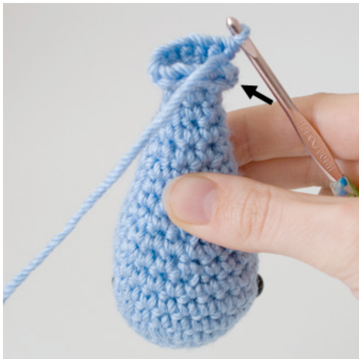
Hook is not at corner of flattened tail (marked by arrow)

Using the position of the eyes as a guide, flatten the open end horizontally. If the hook is positioned at one corner, continue to the tail instructions. If not, sc in each st around until the hook is at one corner (see pictures below), and then continue to the tail instructions.