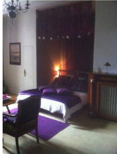
The king size bed...