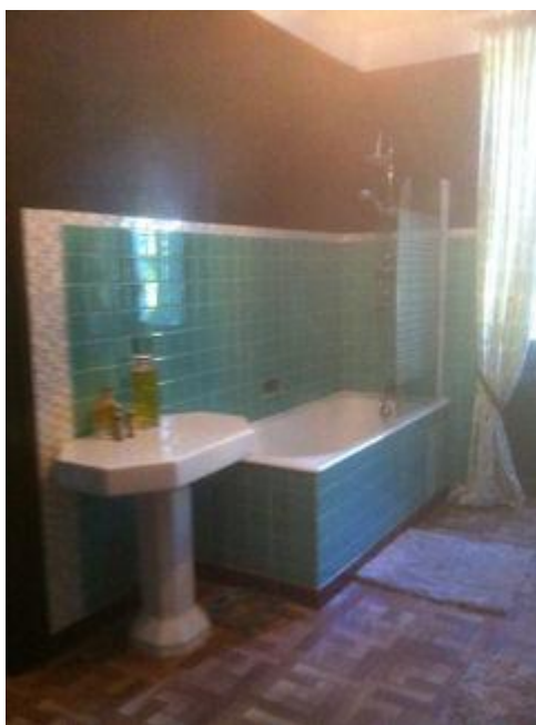
Big private bathroom with double sink, bathtub and WC

Chambres et Table d'hôtes 33 chemin de la vivarié 81100 Castres