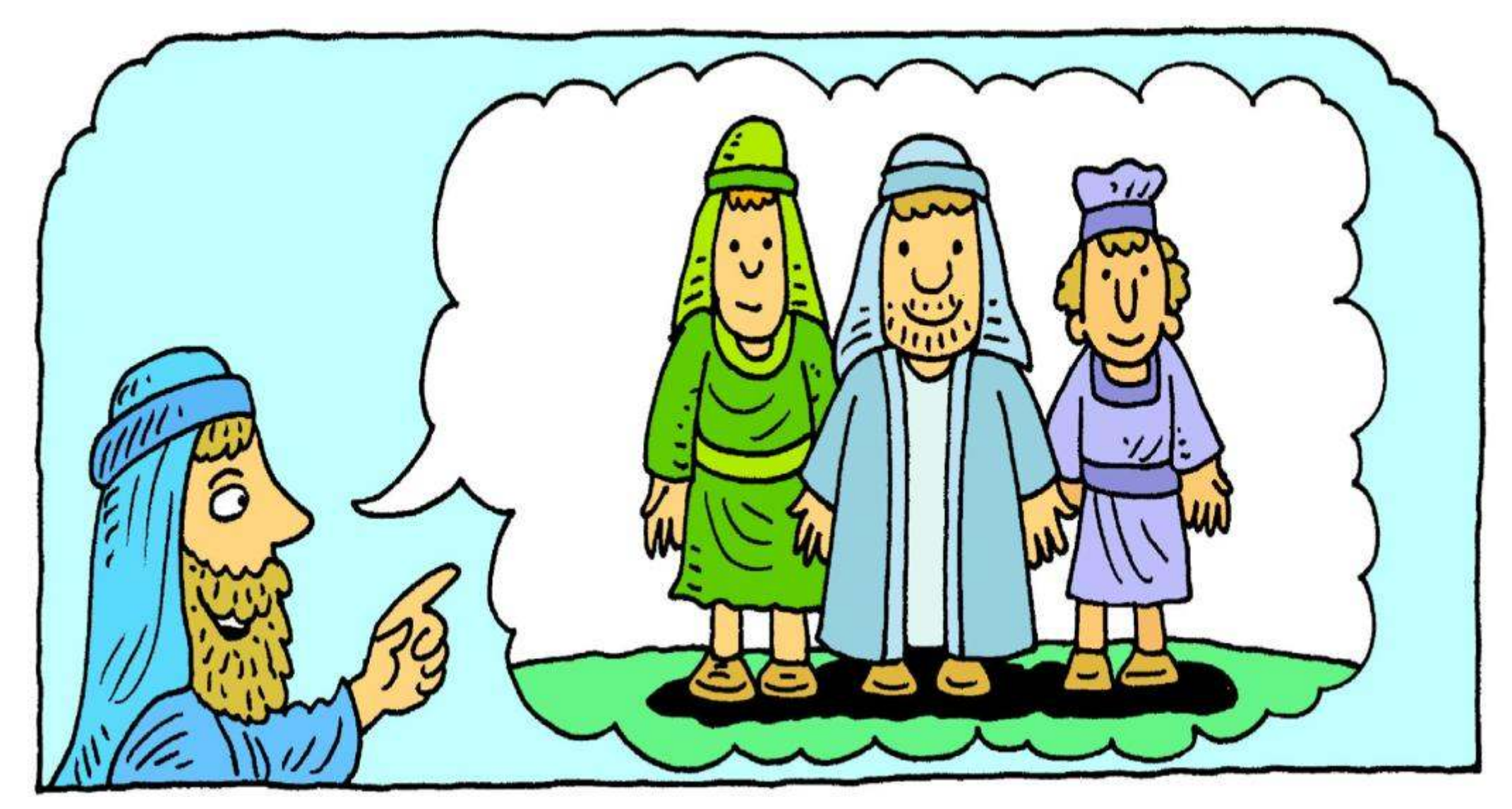
Jesus told this story:

"A farmer had two big boys. They lived and worked on their dad's farm. Some day, when their dad died, they would share all the money he had.