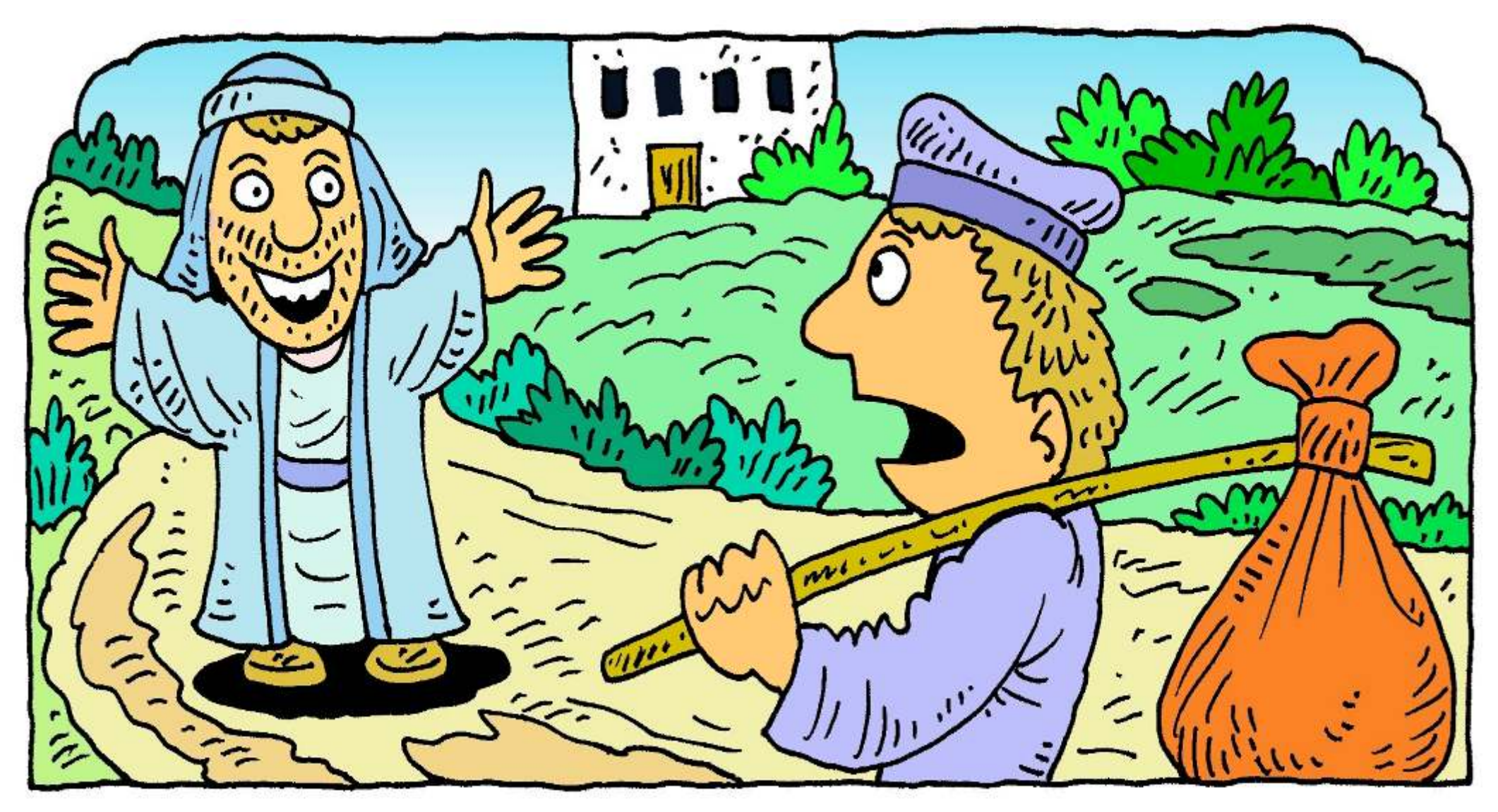
"I will go home and be my dad's servant," he said. "My dad gives his helpers good food." The dad was always watching for his boy to come home and he ran to meet him.