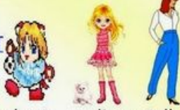
short medium-height tall