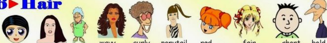
short black hair long black hair grey hair wavy brown hair curly hair ponytail red pigtails fair hair (plaits) short spiky hair bold hair