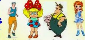
well-built plump fat slim