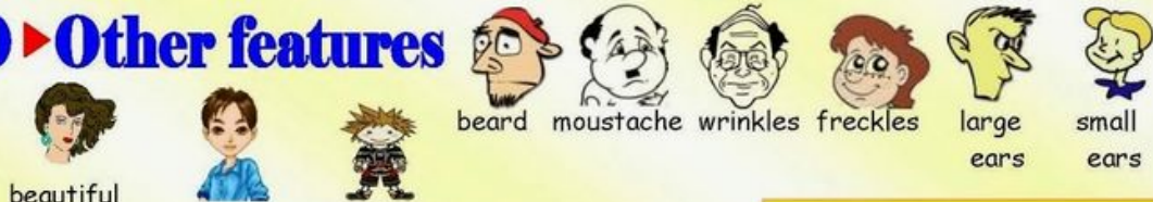
beautiful (pretty) handsome ugly beard moustache wrinkles freckles large ears small ears