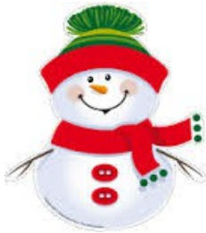
Bonhomme de neige