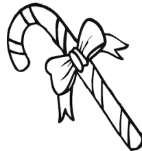
a candy cane