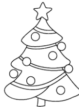
a christmas tree