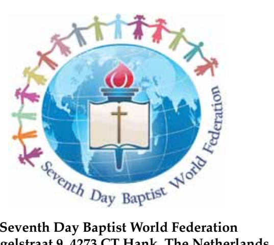
Seventh Day Baptist World Federation IJsvogelstraat 9, 4273 CT Hank, The Netherlands www.sdbwf.org