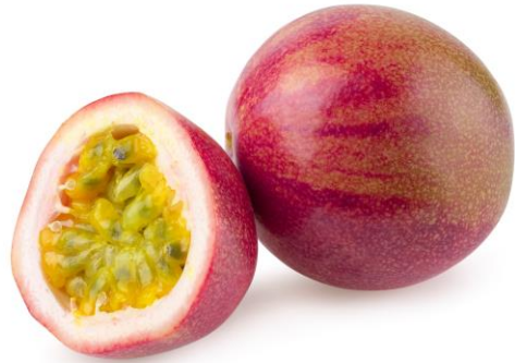
fruit de la passion