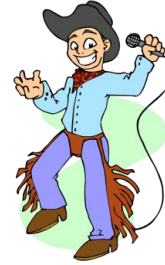
9) singing songs