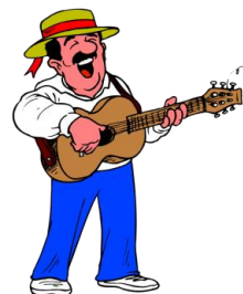
25) playing the guitar