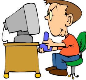
8) playing pc games