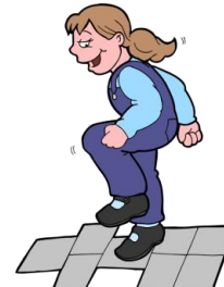
24) playing hopscotch