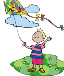
4) flying a kite