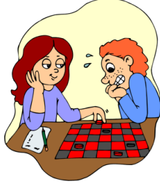
2) playing checkers