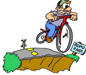
3) riding a bike