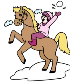
14) riding a horse