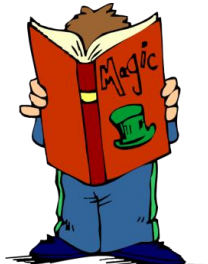
22) reading books