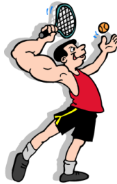
13) playing tennis