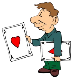
16) playing cards