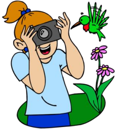
6) taking photos