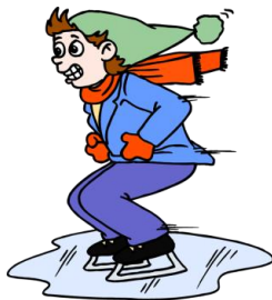
12) ice skating