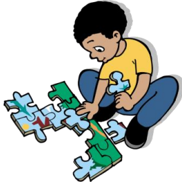
1) doing puzzles