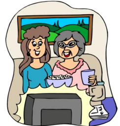
5) watching TV