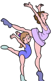
21) doing ballet