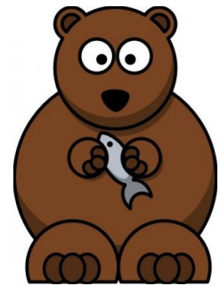
6 - a bear