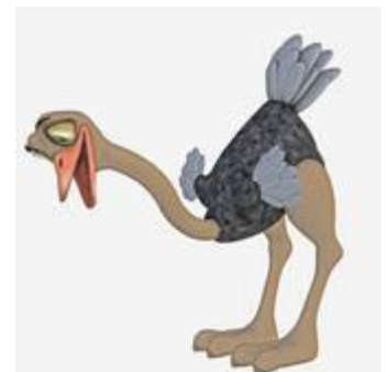
12 - an ostrich