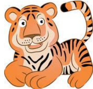
3 - a tiger