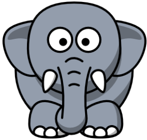
1 - an elephant