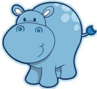
4 - a hippopotamus