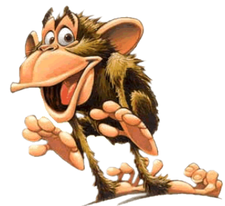
9 - a monkey