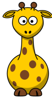
5 - a giraffe