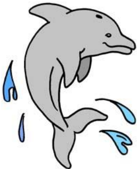
7 - a dolphin