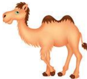
8 - a camel