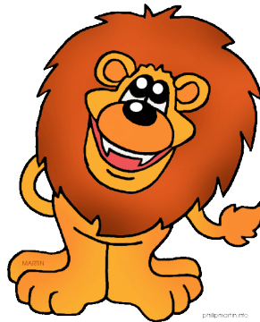
2 - a lion