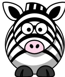
11 - a zebra