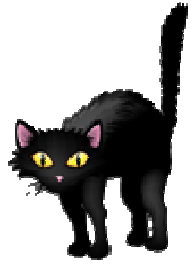
a black cat