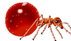
FOURMI A MIEL fourmi à miel